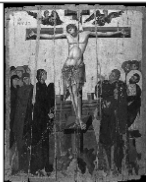
Our Lord came to save us!

Have you ever been afraid of somebody who is really there to help you? Maybe you've been a little scared of talking to a teacher or going to the doctor. Maybe you have seen a police officer or firefighter, and you wanted to hide. Sometimes we are shy or frightened of somebody who is actually there to help us!