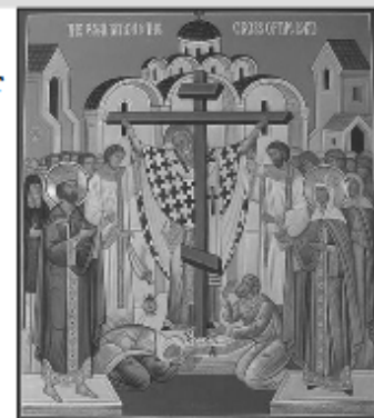
The Cross is precious to Saint Helen, and to us!

Something precious to you is something that means so much to you, something you wouldn't trade for anything! A precious jewel is a diamond or another gem that is worth a lot of money. Something precious to you might not be worth anything to somebody else.