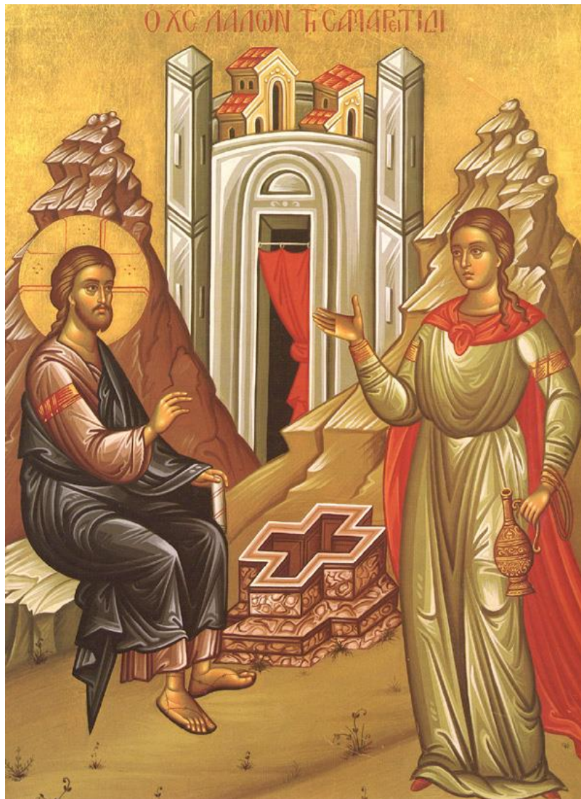
THE 5 th SUNDAY OF HOLY PASCHA: THE SUNDAY OF THE SAMARITAN WOMAN

Sebastian, an official in Italy, said to St Victor, "I know that you, your mother and your brother, are followers of Christ. As a friend I advise you to submit to the will of the emperor. If you inform on any Christians, you will receive their wealth. I shall write to your mother and brother, asking them not to preach Christ in public. Let them