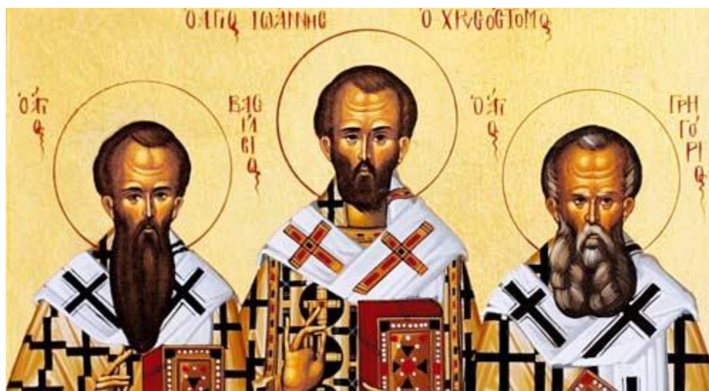
1. From left to right: Saint Basil the Great, Saint John Chrysostom, Saint Gregory the Theologian (detail).

The Three Hierarchs are depicted in the icon of the feast full-bodied and in a frontal pose. They are dressed in their hierarchical vestments, indicating their position as bishops of the Church. Saint John Chrysostom stands between Saint Basil (to his right) and Saint Gregory (to his left).