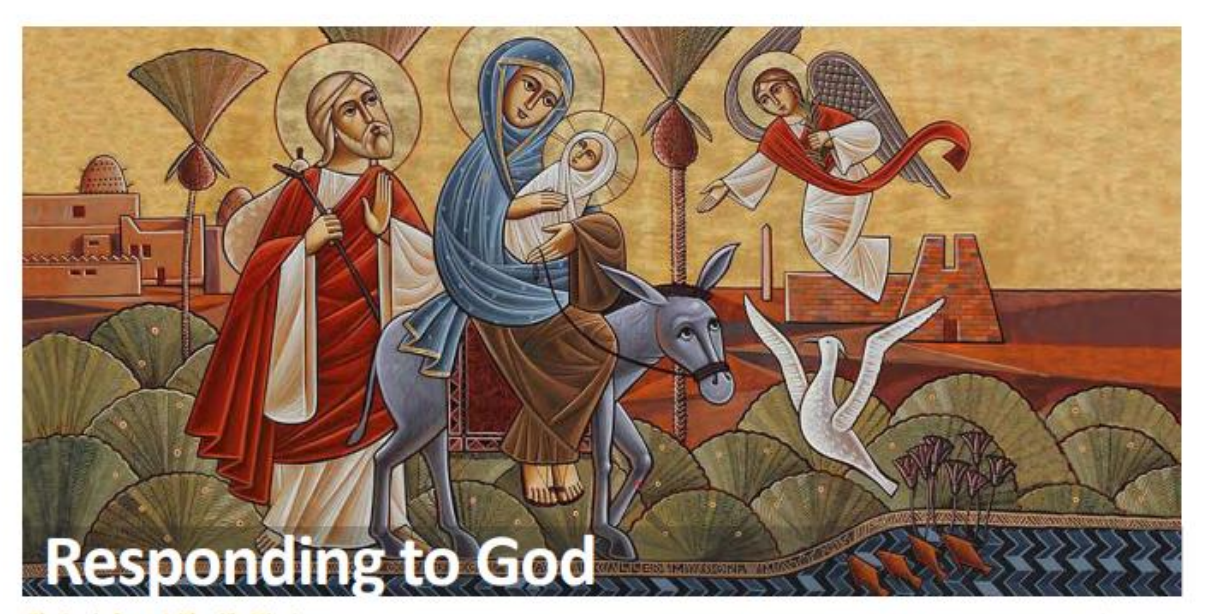
Christ is born! Glorify Him!

As we continue the celebration of our Lord's Nativity in Bethlehem, we remember how different people responded to the birth of Jesus Christ .