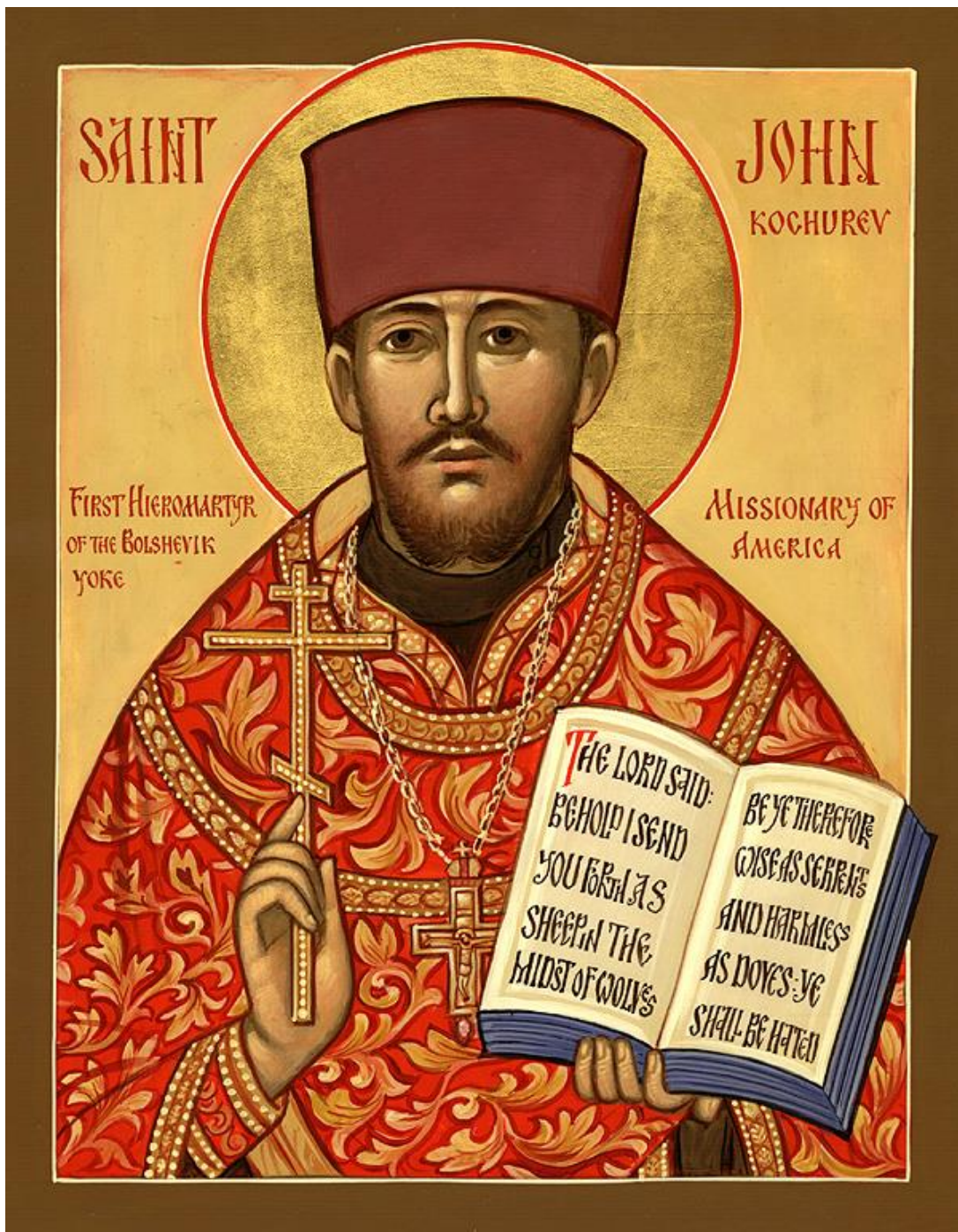
ST. JOHN KOCHUREV - HIEROMARTYR AND MISSIONARY OF AMERICA