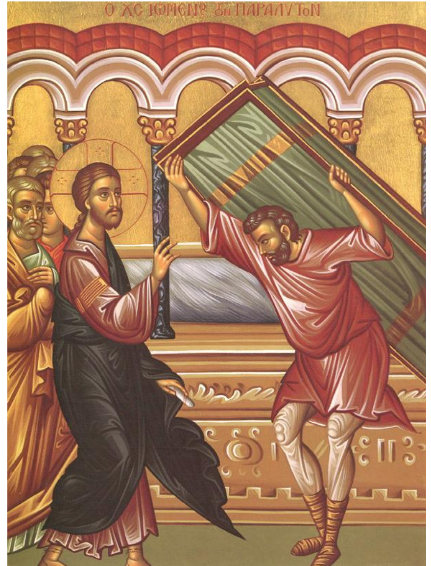
THE 4 th SUNDAY OF HOLY PASCHA: THE SUNDAY OF THE PARALYTIC